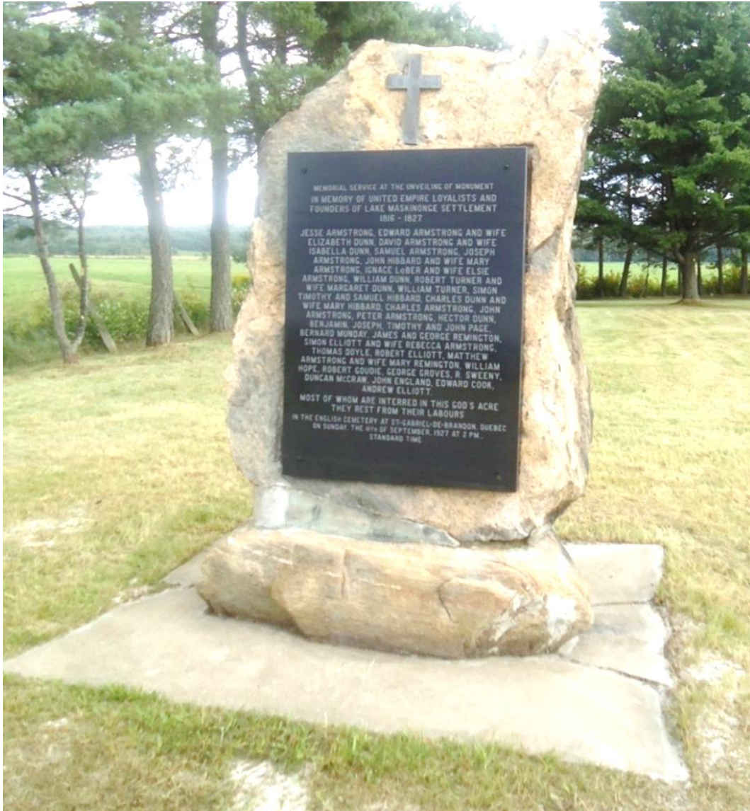
Loyalist Settlers Monument - Saint-Gabriel-de-Brandon

https://uelac.ca/monuments/loyalist-settlers-monument/