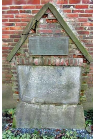
Gravestone of Sir John Johnson -1830

http://100objects.qahn.org/content/gravestone-sir-john-johnson-1830